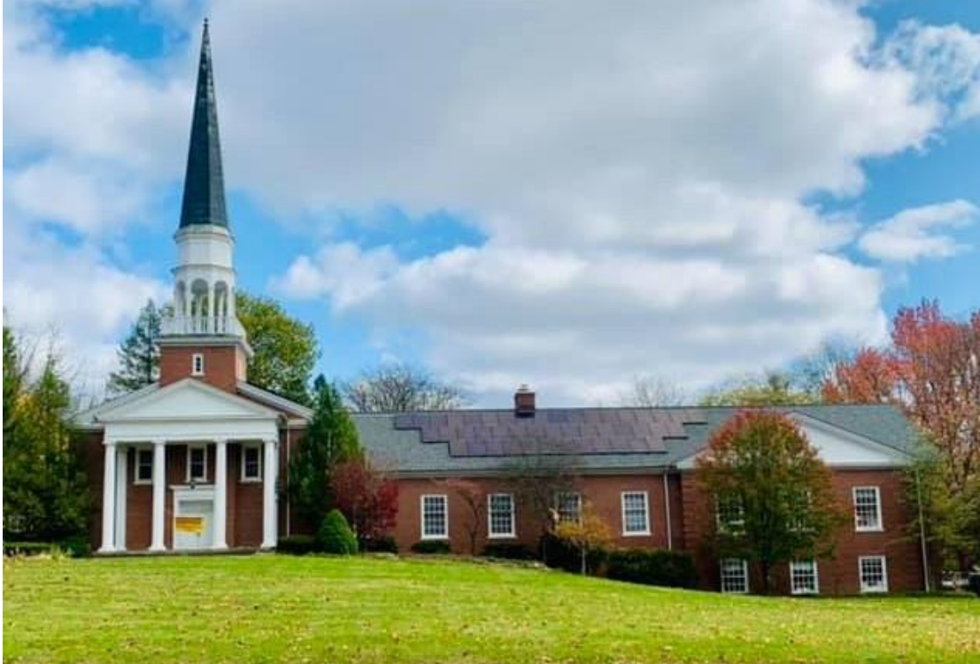
Photo of First Congregational UCC with solar panels