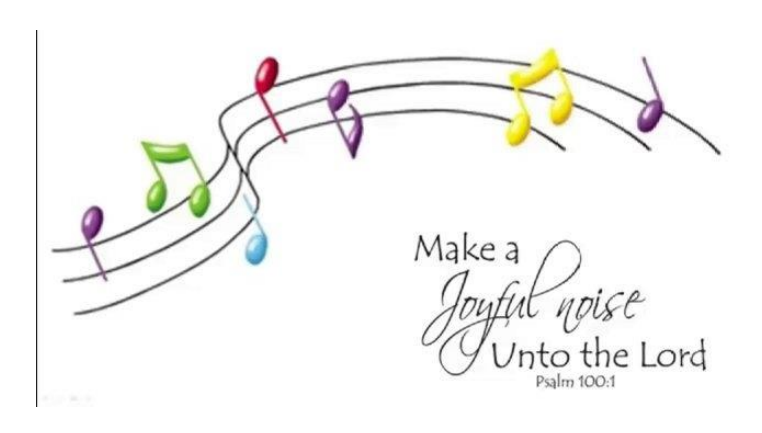
What's Happening at FCC

This Sunday we celebrate music as we join together in a Hymn Sing! Scripture: Psalm 100