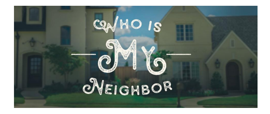
What's Happening at FCC