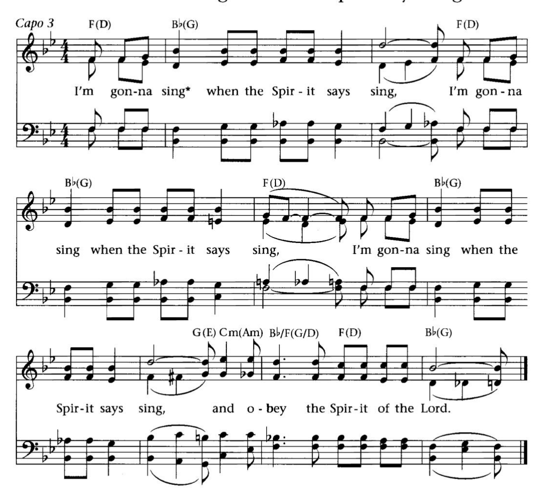
*pray, shout, dance