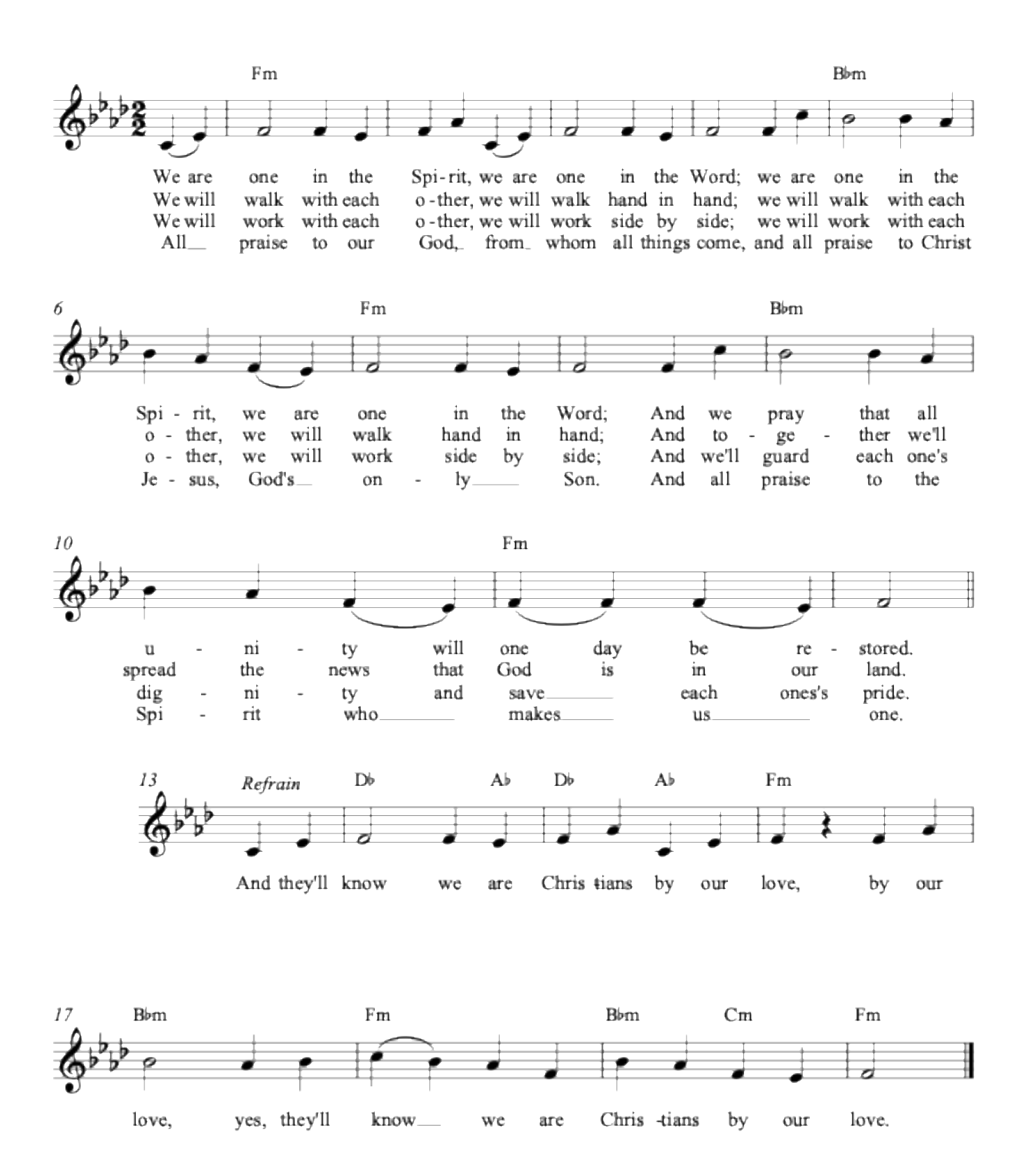
They'll Know We Are Christians